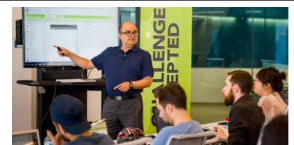
Faculty and Instructors